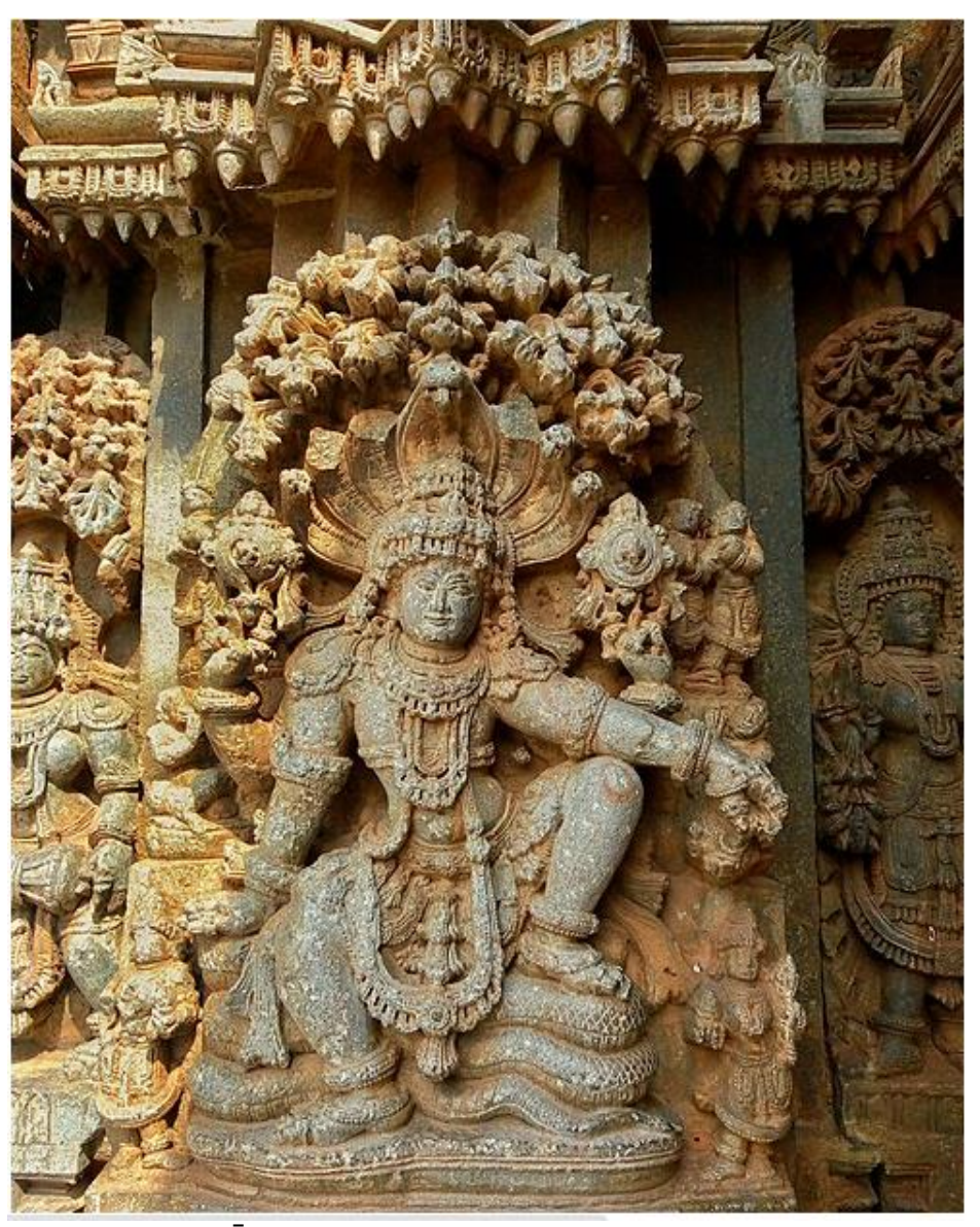
Viṣṇu sitting on Ādiśeṣa. Sri Chennakeshava Temple. Somanathapura