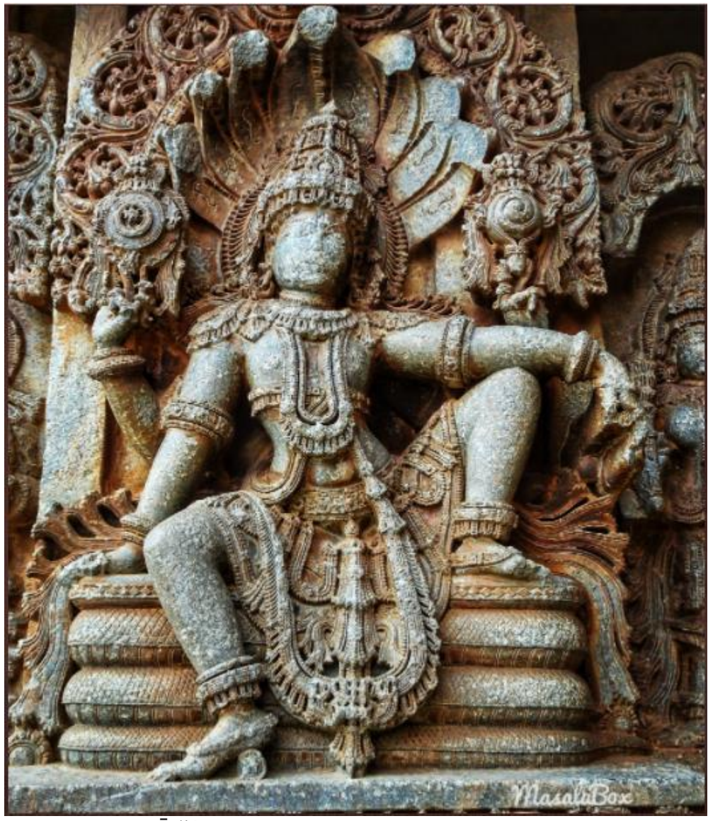
Viṣṇu sitting on Ādiśeṣa. Lakshmi Narayana Temple, Hosaholalu