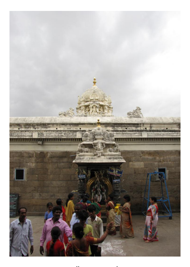
Vellore Fort temple

This event will be followed, from 19^{th} to 30^{th} of August, by the annual Classical Tamil Seminar of the EFEO Centre at Pondicherry, devoted this year to the reading of the Mullaippāṭṭu, one of the long poems of the Pattuppāṭṭu.