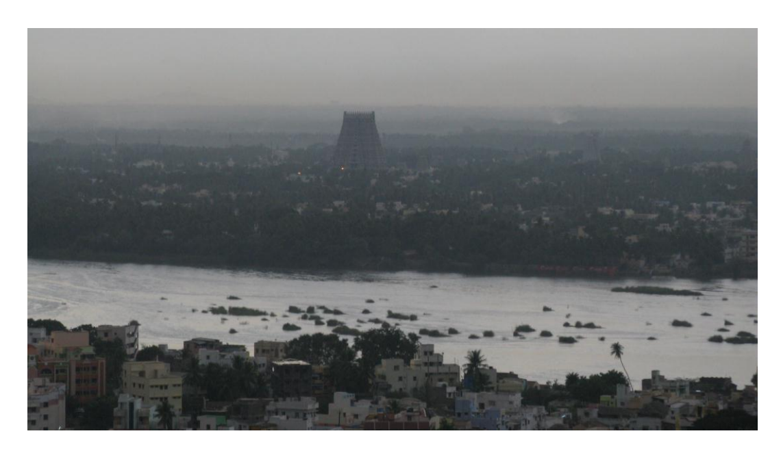
Śrīraṅganātha temple, Tiruccirāppaļļi