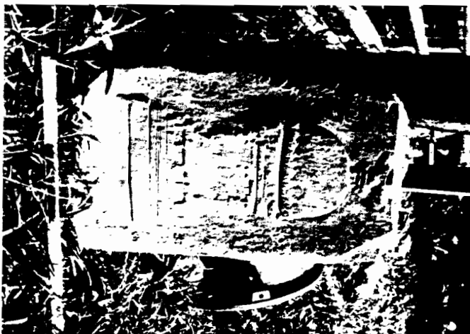
Plate 1 Photograph of Kampung Sungai Mas inscribed tablet.

The rock used is gray-green on the surface, but it could not be inspected beneath the weathered cortex; shales in the area often show a greenish cortex but may be red-brown beneath the surface. The surface fracture pattern and zones of previous breakage reveal a bedded and platy sedimentary structure like that of slate or shale; the rock, however, seems soft for slate. Surface examinations of color, texture, and structure suggest that the material had probably derived from Bukit Meriam. I have suggested to the Muzium that a small fragment of the rock be removed for petrographic examination in thin section, in order to identify the lithic type with certainty (Allen-Wheeler 1980). Precise identification of the rock used is important for reconstruction of the history of manufacture and use of the tablet. Earlier researchers have suggested that other tablets from the area were imported, usually from India. I